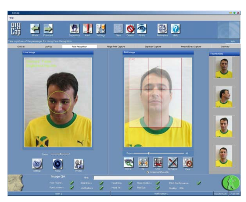
Photo is the photo live capture module inside the BioCap application. Photo is an easy to use module which is designed especially for and obtaining capturing uniform images of good quality, according to the standards for identification of documents that quality assures the images according to the ICAO guidelines standards and photographs for travel documents. As a special feature photo will find the eyes automatically, will adapt the capture frame alongside the position of the eyes, and will automatically crop the image according to the predefined frame, if desired.